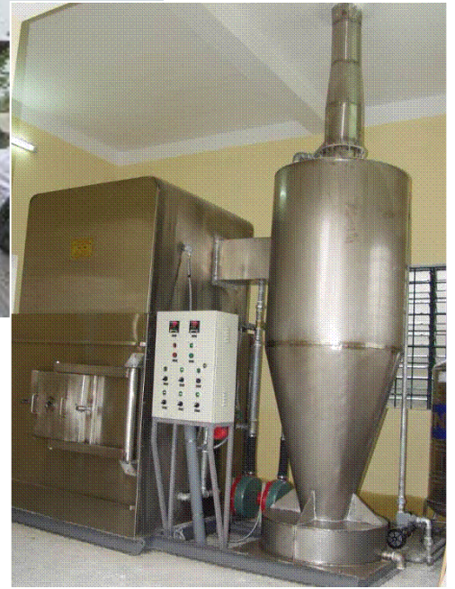
Introduction of incinerator for healthcare waste management (VTE+LPB)