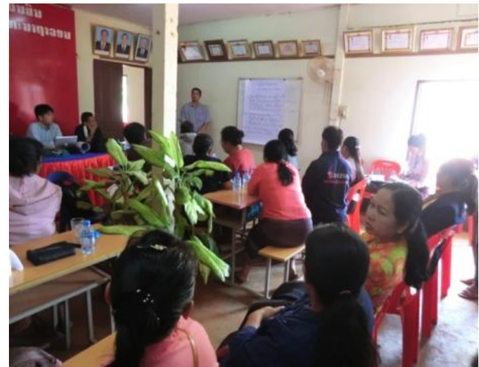
Kickoff meeting on 3R with village residents (3 cities)