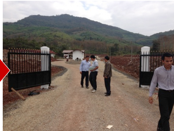
Improved access road to the final disposal site (Luang Prabang)