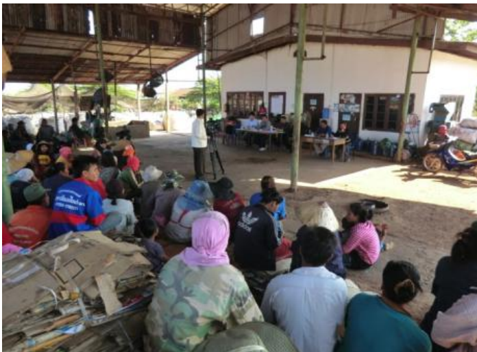
Meeting with waste pickers for their safety (3 cities)