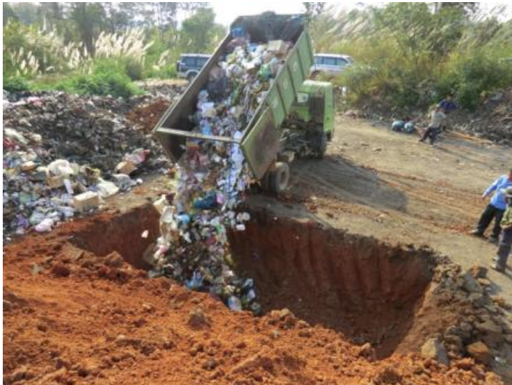
Training of landfill operation "trench-method" (Xayabouri)